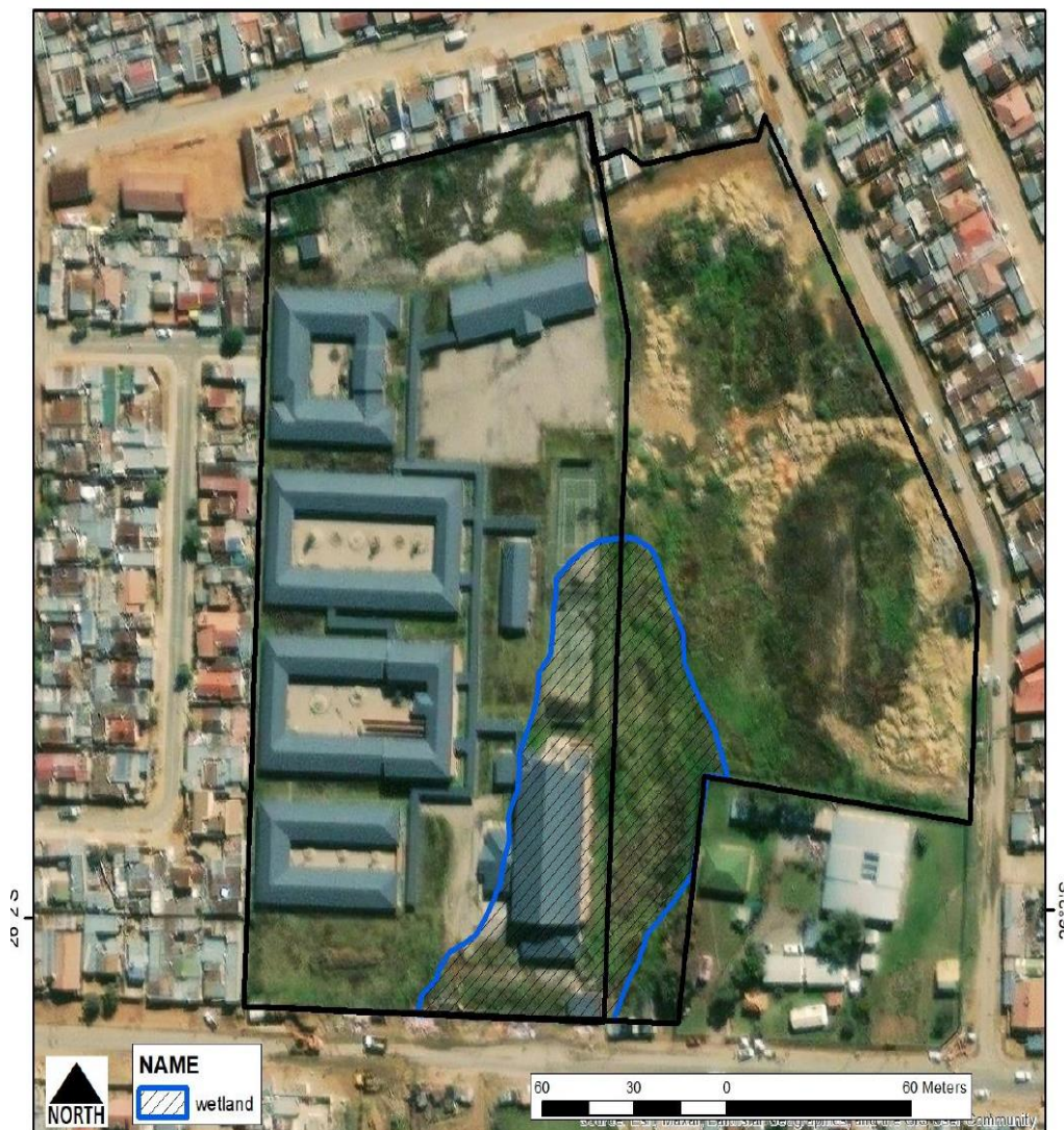
Figure 2. Wetland superimposed on the 2023 Google image

The version of the Gauteng Department of Agriculture, Rural Development and Environment (GDARDE)