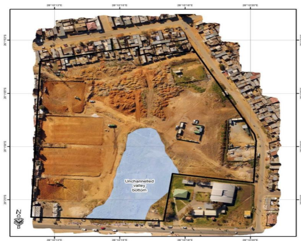
Figure 1. Indicating the wetland and 32m buffer on the drone image taken during the time of the survey (indicating the construction of the platforms and ground dumps in the northern part of the site)

6.2.18 Dr Gouws further furnished the Investigation Team with the following aerial photograph, which depicts the position of the wetland currently, as it superimposes on the southern section of the location where Mayibuye Primary School is built: